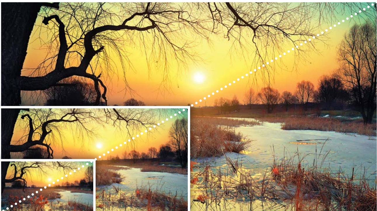
Full HD 1920 x 1080